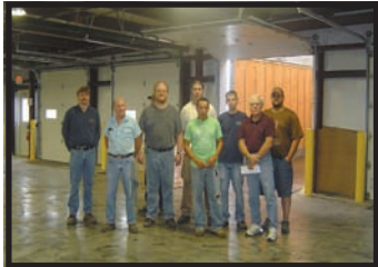
Warehouse and maintenance staff at LTI Printing pose in front of new loading docks, a part of the company's recent expansion project.

LTI Printing, a locally owned and operated printer of pressure sensitive labels and folding cartons, recently completed a building expansion and improvement project. The facility additions and remodeling targeted enhancements to product flow and material storage efficiency. The largest building addition provided ground level access, four loading dock structures, provisions for a waste compactor, and a new chemical storage room. A key element was the large staging area for improved material receiving and product shipments to destinations throughout the U.S., Canada, and Mexico. Building improvements included the reclaiming of internal truck docks to utilize the floor space and higher ceilings for storage efficiency. This successful project was achieved with special cooperation from corporate neighbor Parma Tube and the City of Sturgis. A sincere thank you also goes out to all LTI employees who continued to produce quality product during this time of construction.