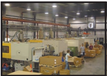
A peek inside the new manufacturing space at Sturgis Molded Products Co.